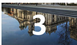
Link 3 1920x1080