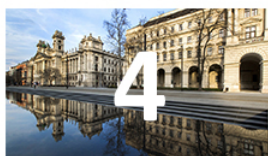
Link 4 1920x1080