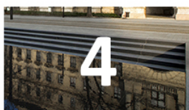
Link 4 1920x1080