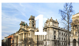
Link 1 1920x1080