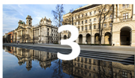
Link 3 1920x1080