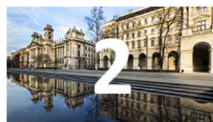
Link 2 1920x1080