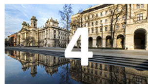
Link 4 1920x1080

2SI method allows picture monitoring on standard 1080P displays as each link carries the whole image at 1/4 of its original resolution