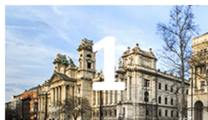
Link 1 1920x1080