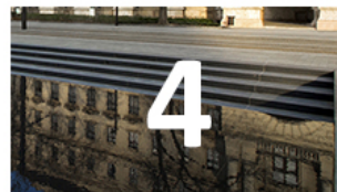
Link 4 1920x1080

Each quadrant comprises exactly 1/4 of the UHD Image (so a 1920x1080 HD image)