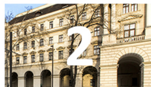
Link 2 1920x1080