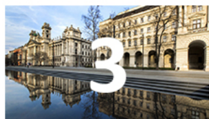
Link 3 1920x1080