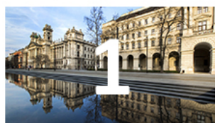
Link 1 1920x1080