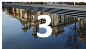
Link 3 1920x1080